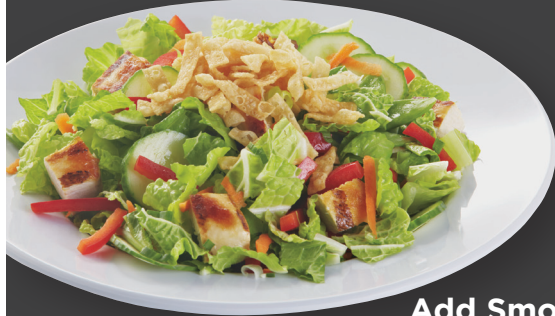
ASIAN CHICKEN SALAD