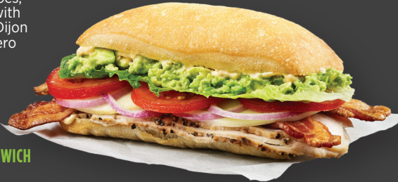
CHIPOTLE TURKEY BACON & AVOCADO SANDWICH